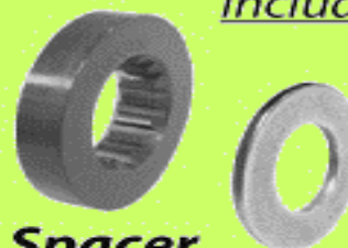
Aft Spacer (#81053150) included in kit