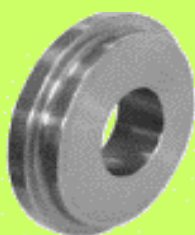
Thrust Washer (#81013350) included in kit